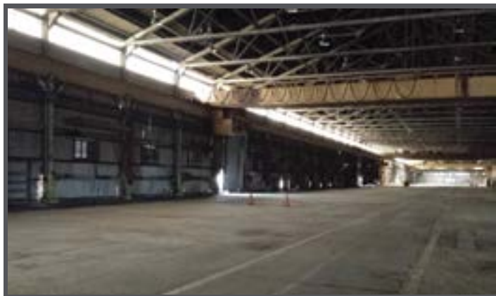
Vertex's newly acquired manufacturing plant before construction