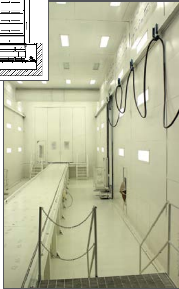
Full down draft pain booth with pneumatic manlifts

Vertex Rail's entered into the railcar manufacturing market with enormous production capability with a fraction of typical finishing labor costs.