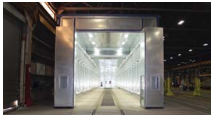
Ultra-high speed AquaTec cure booth

BlastOne became the obvious partners for the project due to their experience and unique partnership with automation companies.