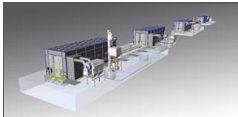
BlastOne's proposal consisted of 4 in-line booths to maximize space and finishing efficiency, while still allowing room for future expansion.