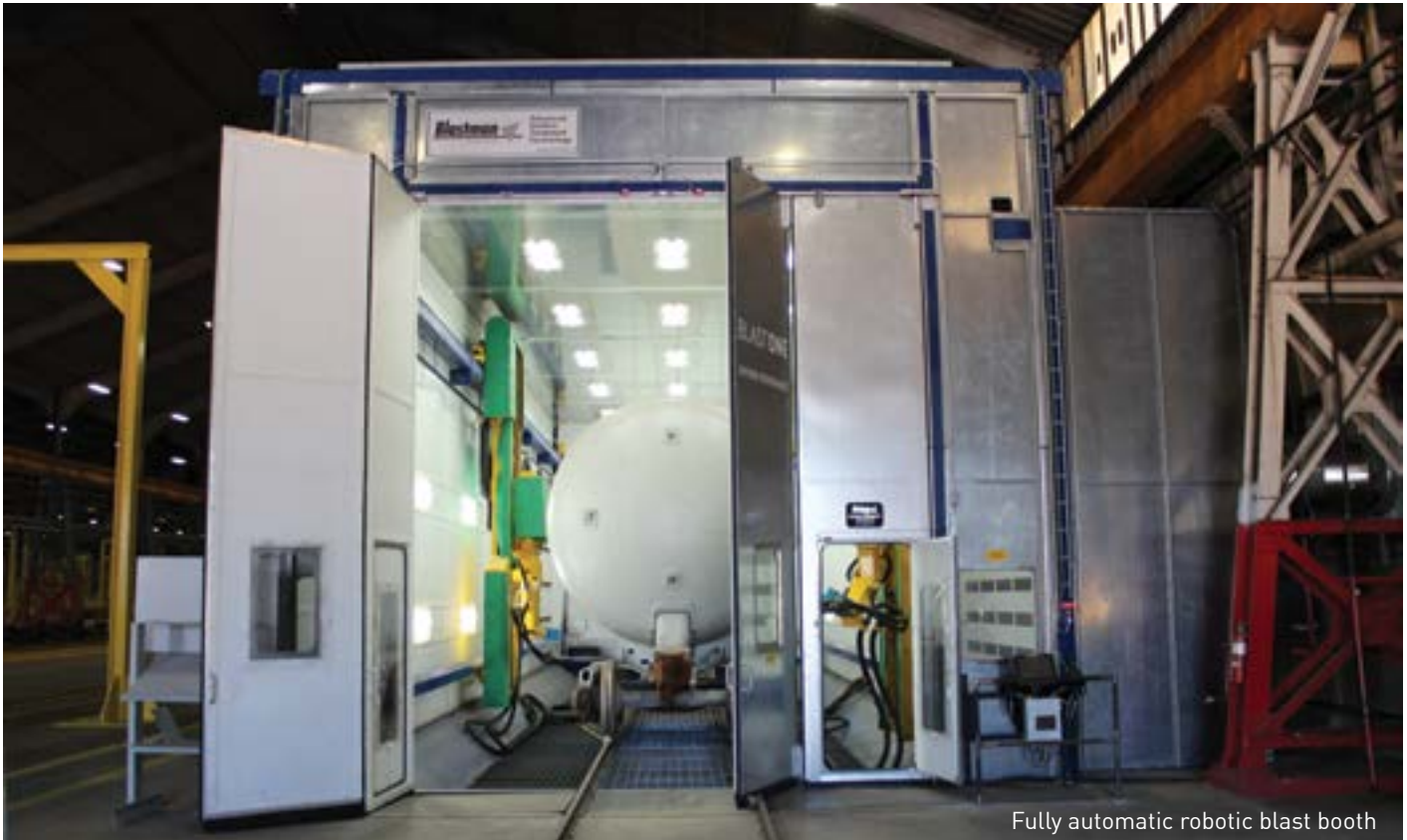
Fully automatic robotic blast booth