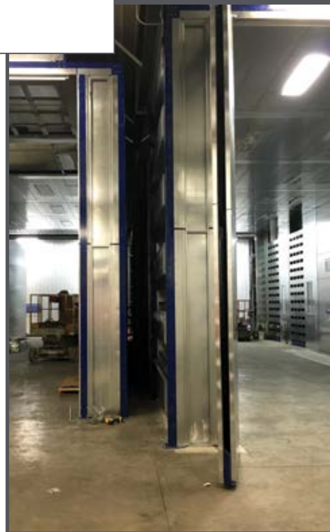
The completed booths were constructed in extremely close quarters, with less than 18" of clearance