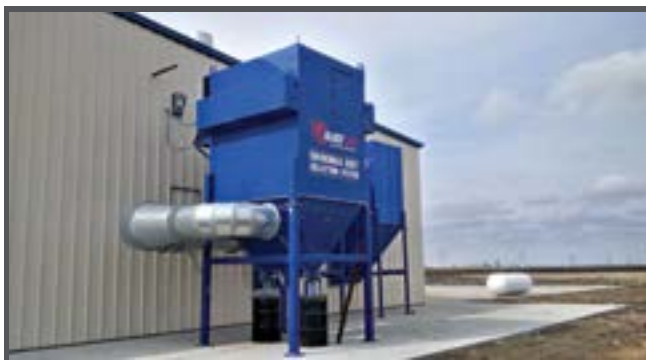
State-of-the-art Dust collection system

Nearly all manufactured materials are finished onsite, lowering project costs and increasing competitive advantages.