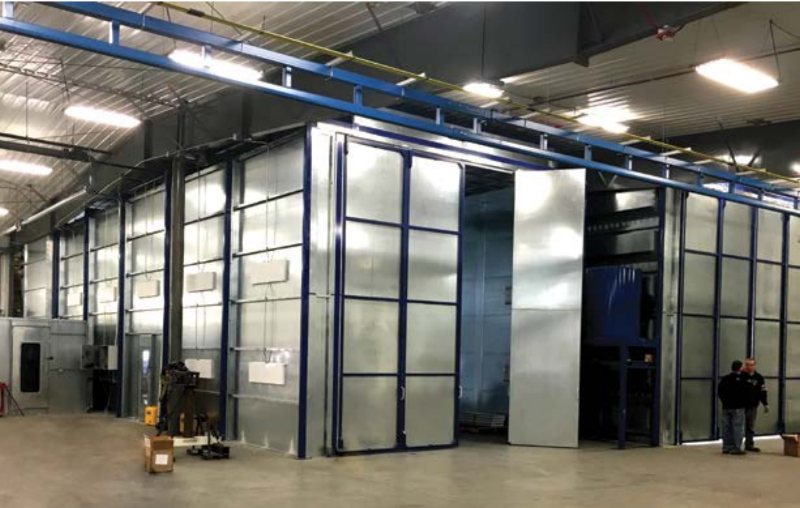
Completed inhouse finishing booths