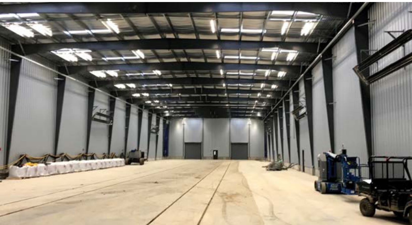
Finalized finishing facility designed with space for an entire barge during the finishing process