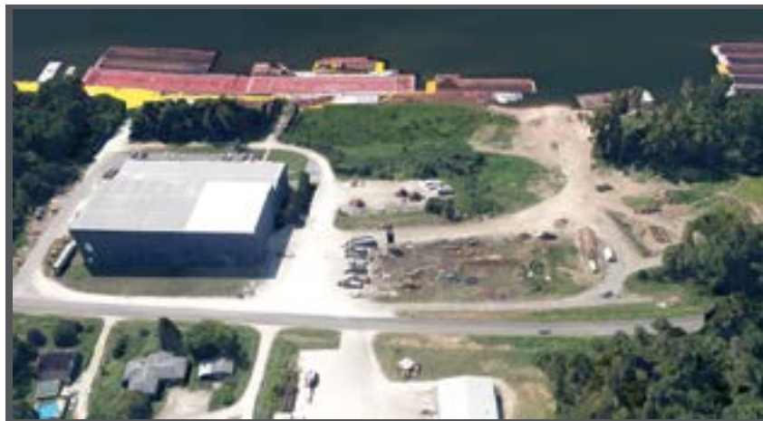
Aerial view of Superior Marine's facility site before construction

Superior Marine wanted to roll out the ability to blast and paint barges indoors as an additional service in their river barge business sector.