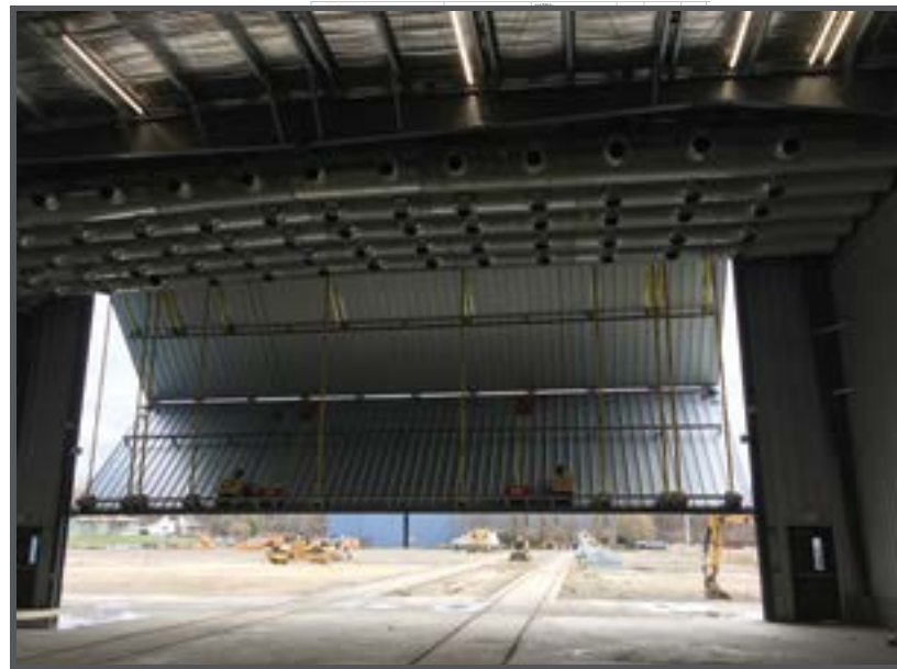
Completed blast and paint hall with directional air nozzles shown

BlastOne's scope included a complete compressed air plant capable of producing 2500CFM at 150PSI