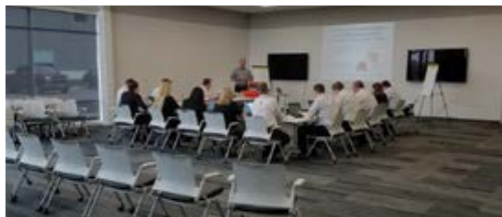
NEW DEDICATED TRAINING CENTER AT BLASTONE HQ IN COLUMBUS OHIO

BlastOne is determined to make quality training accessible to workers in the field, and raise the level of performance industry-wide.