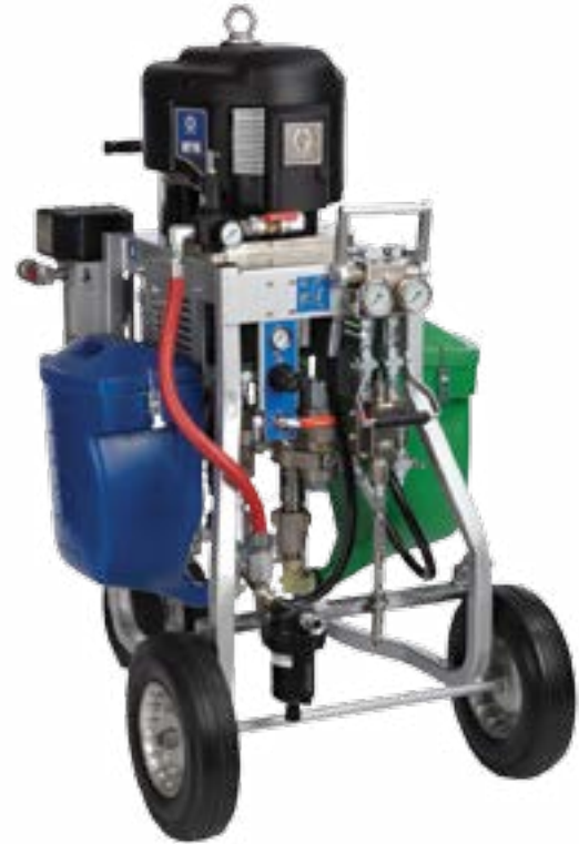
GRACO XP70 PLURAL-COMPONENT SPRAYER

High-pressure performance for two-part high-solids coatings