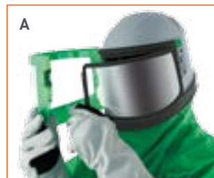
A Simply unclip the lens frame and remove it from the helmet.

The patented Nova 3 inner lens system reduces downtime to a minimum. The procedure is quick, clean and easy – even while wearing blasting gloves.