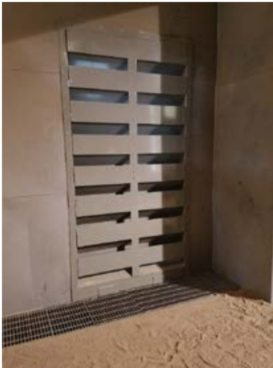
BLASTONE'S PROPRIETARY AIR INLET PLENUMS DRASTICALLY INCREASED AIRFLOW CAPACITY IN THE BOOTH AND REDUCED MOTOR STRAIN ON THEIR DUST COLLECTOR

Their dust collection improvement changed the visibility in the booth. The upgrades solved their safety concerns and produced a significant boost to blasting throughput.