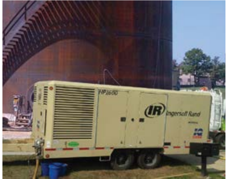
TYPICAL BLASTING COMPRESSOR

See page 424 of the BlastOne catalog for a nozzle consumption chart.