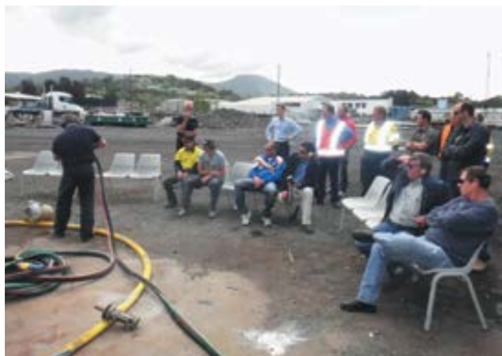
ONSITE TRAINING USES YOUR JOBSITE AND EQUIPMENT TO ENSURE YOUR TRAINING WORKS FOR YOU