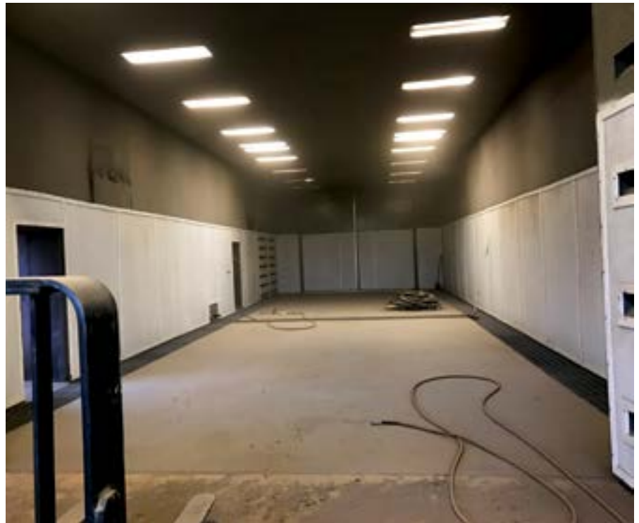
THE NEWLY-INSTALLED BLAST WHITE SHEETING HELPED IMPROVE VISIBILITY WITHIN THE BOOTH WHILE ALSO INCREASING THE OVERALL LIFE OF THE BOOTH