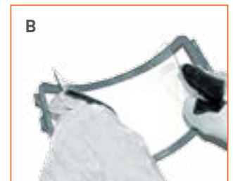
B Remove the old lens and replace it with a new lens. Clip the frame back into place!