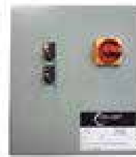
UL & ETL LISTED CONTROL PANEL