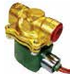
AIR SOLENOID VALVE