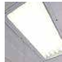
INDUSTRY-LEADING LIGHT LEVELS