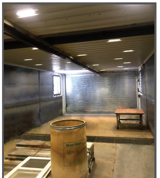
The interior of Advanced Surface's newly minted blast and paint booth

BlastOne then outfitted the booth with an abrasive recovery system and dust collection equipment.