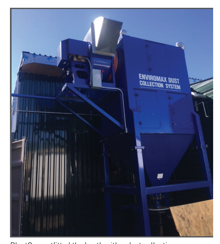
BlastOne outfitted the booth with a dust collection system to ensure worker safety and to reduce waste