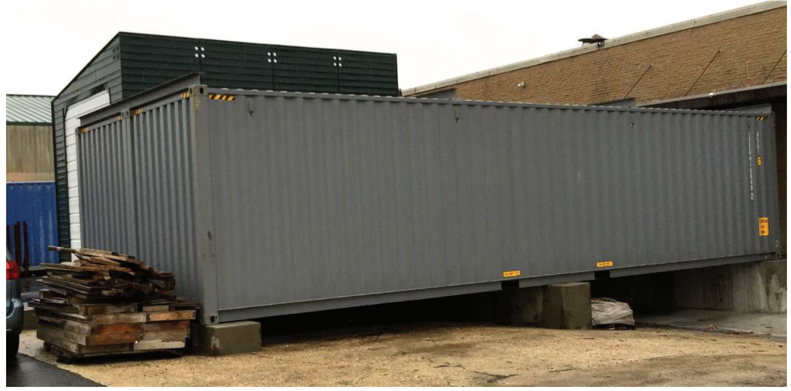
The exterior of Advanced Surface's blast booth, made of two shipping containers welded together