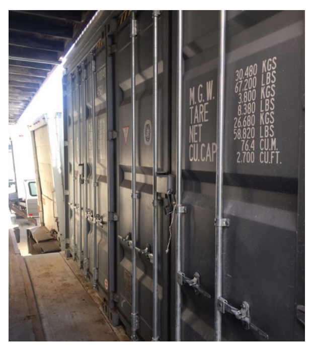
Working under extreme limitations, BlastOne and Advanced Surface curated a customized solution

Advanced Surface wanted to migrate their sandblasting operations in house to give them greater control over costs, lead-times, and service availability for their customers.