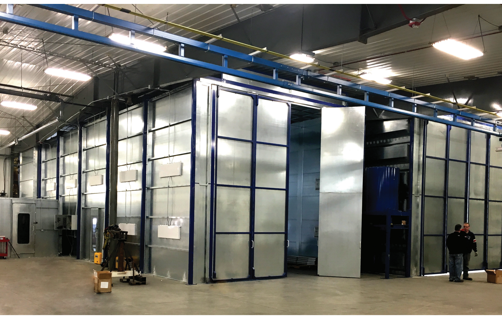
Completed inhouse finishing booths