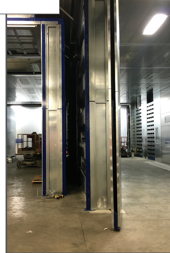
The completed booths were constructed in extremely close quarters, with less than 18" of clearance