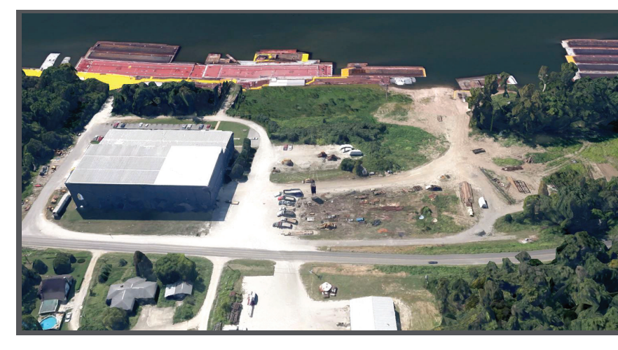
Aerial view of Superior Marine's facility site before construction

Superior Marine wanted to roll out the ability to blast and paint barges indoors as an additional service in their river barge business sector.