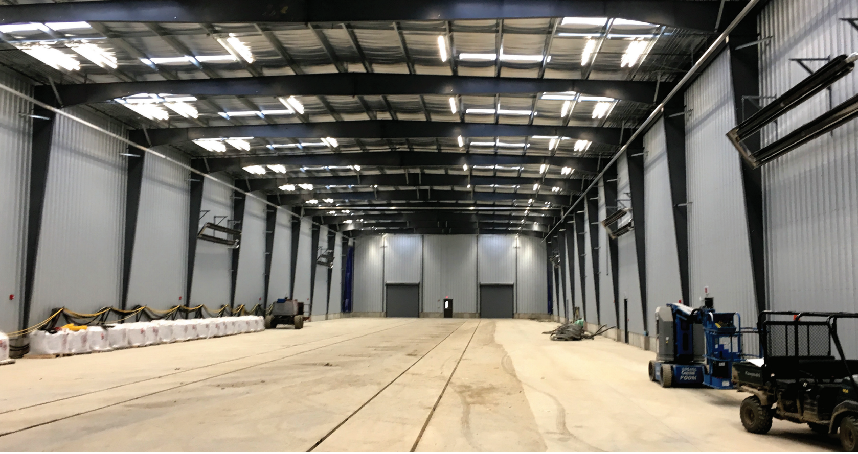
Finalized finishing facility designed with space for an entire barge during the finishing process