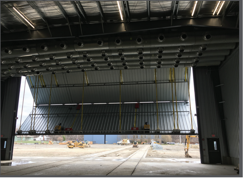
Completed blast and paint hall with directional air nozzles shown