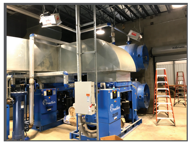
BlastOne's scope included a complete compressed air plant capable of producing 2500CFM at 150PSI

The facilities were outfitted to serve both functions to drive down initial costs for the company.